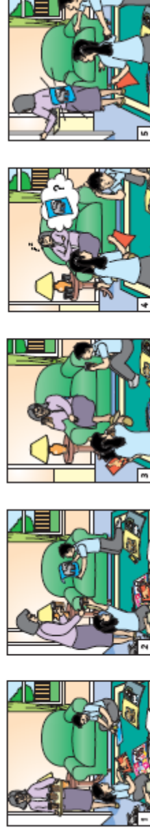
Test 10 Picture Story