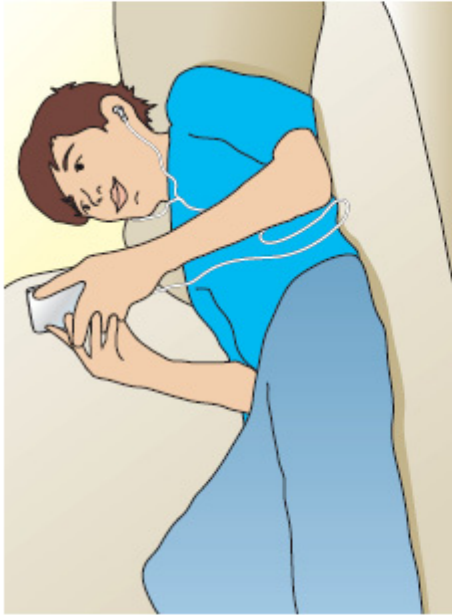
Tony's favourite song